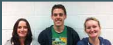
LSL-Mi Bus Multimedia