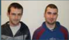
Safety While Driving Electronic Engineering