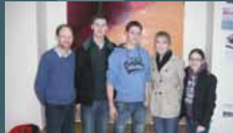
Agri App Way Business Information Systems Agriculture