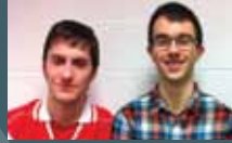
AdLift Advertising Multimedia