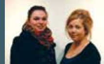
Smart Sense Multimedia