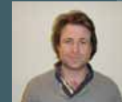
Sugar Diary Electronic Engineering