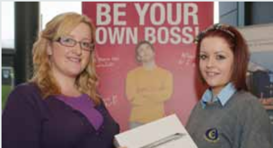
During the CIT Open Day, November 2011, CIT ran a "Bright Ideas" competition for second level students to get them to start thinking about new products/businesses.

In addition to the CIT Prize for Innovation Awards there are a number of events throughout the year to inspire entrepreneurial spirit on campus. The 'Fugitive' Competition run by the (entrepreneurial) Ideahub Society encourages students to learn about the entrepreneurial ecosystem on campus in a fun and engaging way. Lucky winners who do their research and find the fugitive receive a cash prize.