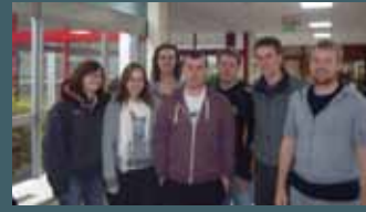
Pyra Aid Biomedical Engineering Mechanical Engineering Accounting