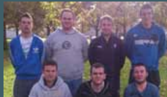
Quick Tyre Fix Mechanical Engineering Biomedical Engineering Accounting