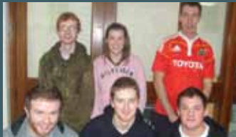
Safety 4B Solutions Mechanical Engineering Biomedical Engineering Business