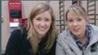
Sense Saying Hello Business Administration Visual Communications