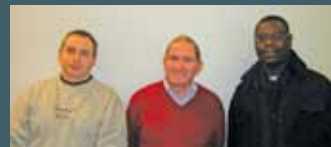
Injury App Entrepreneurship & Business Springboard